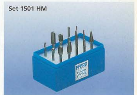
Set 1501 HM